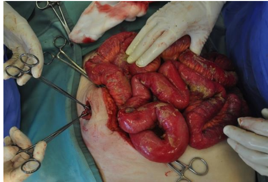
Lough Eske Castle Donegal